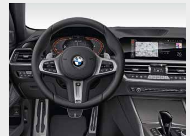
Variable Sport Steering