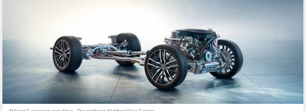
M Sport Suspension and xDrive - The intelligent All-Wheel Drive System