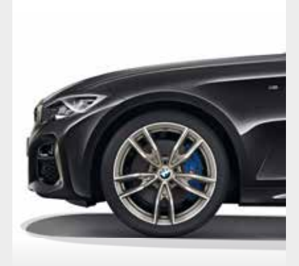
M Sport Brake