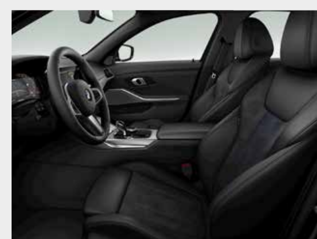
Sport Seats in Alacantara/Sensatec combination upholstery with M Seat Belts

<sup>1</sup>The information in the BMW Head-Up Display is not fully visible when viewed through polarised sunglasses. Content shown will depend on the equipment options chosen. Further optional equipment is required to display specific items.