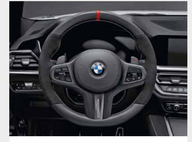
BMW M Performance Steering Wheel in Alcantara and Carbon Fibre