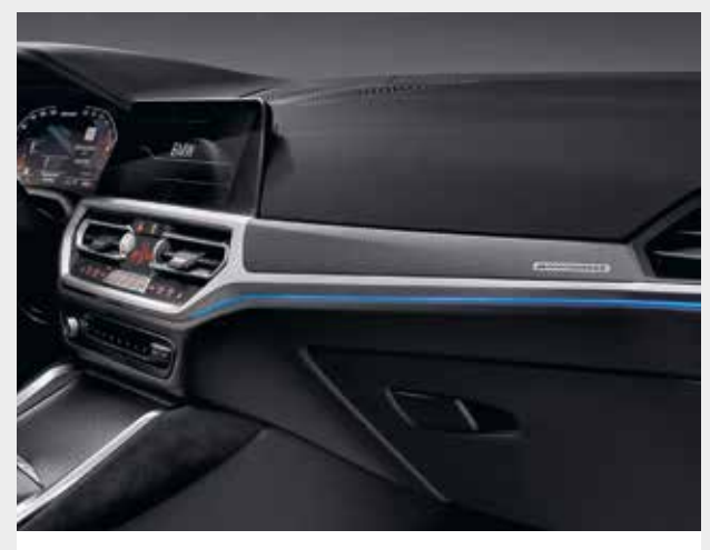
BMW M Performance Interior Trim in Carbon Fibre