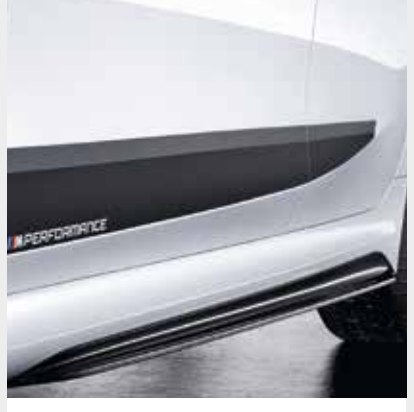
BMW M Performance Side Skirt Attachment in Black High-Gloss