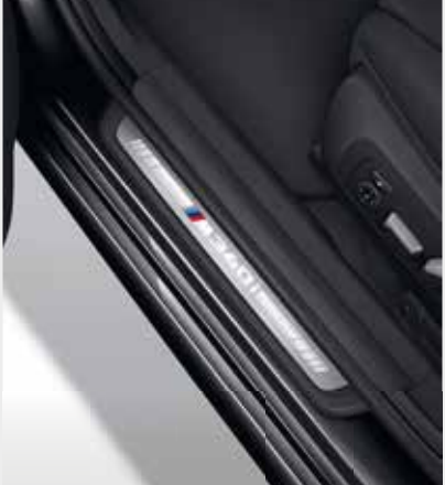
M Specific Door Sill