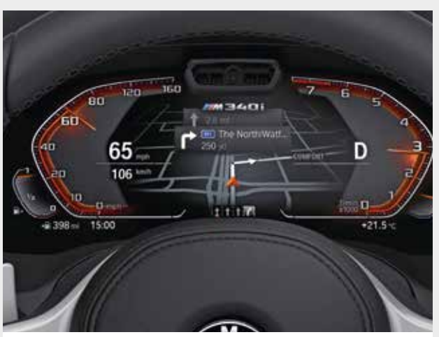
BMW Live Cockpit Professional with M340i specific display