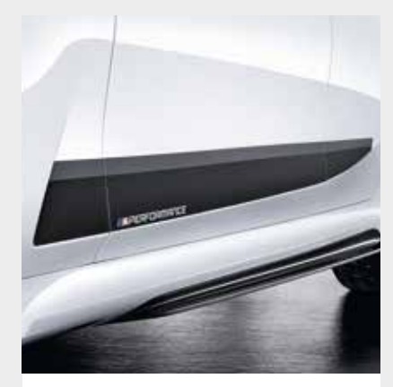
BMW M Performance Side Skirt Films in Frozen Black