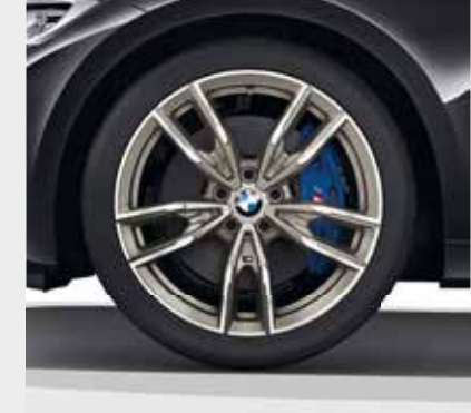
19" 792 M Light Alloy Wheels in Cerium Grey