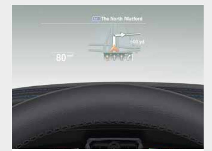
BMW Head Up Display<sup>1</sup>