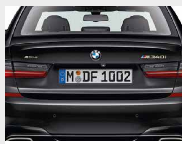
M Rear Spoiler in body color