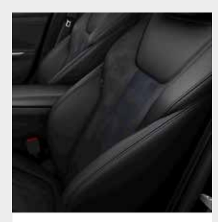
Alcantara Sensatec combination Black | contrast stitching Blue | Black

[ Colours ] The colours printed above are intended to provide you with a first impression of paints and materials available for your BMW. Experience has shown, however, that printed images of paint, upholstery and interior trim colours cannot faithfully reproduce the actual appearance of the originals. We recommend therefore that you consult your BMW partner who will be able to show you original samples and assist with special requests.