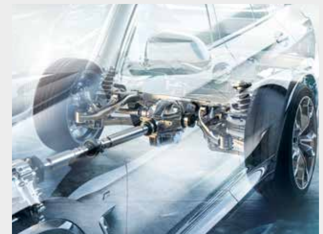
M Sport Differential