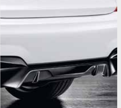
BMW M Performance Diffuser* in Carbon Fibre. Also available in Matt Black