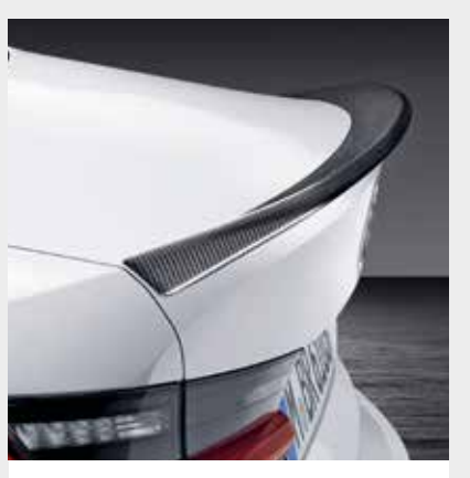
BMW M Performance Rear Spoiler in Carbon Fibre